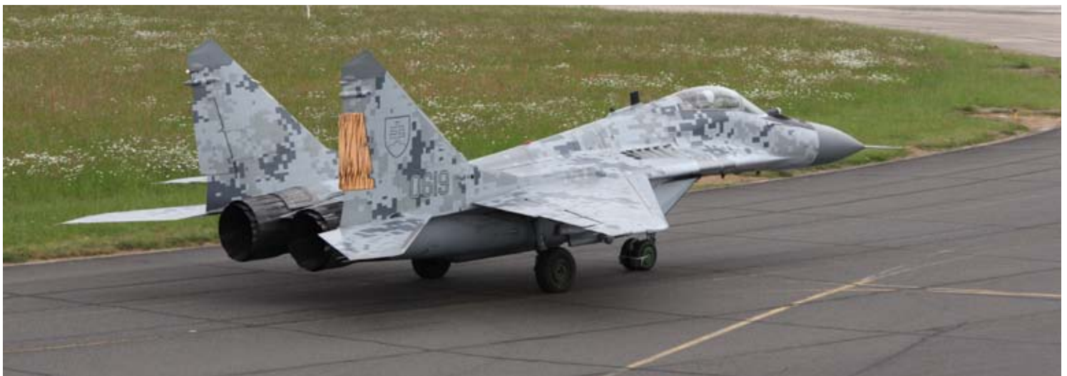
MiG-29's of 1 SQN from Sliac in Slowac Republic flew also a few Missions